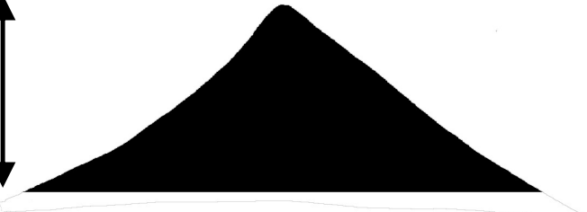
stratovolcano or composite cone